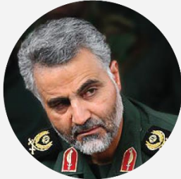
IRGC Major General Qasem Soleimani