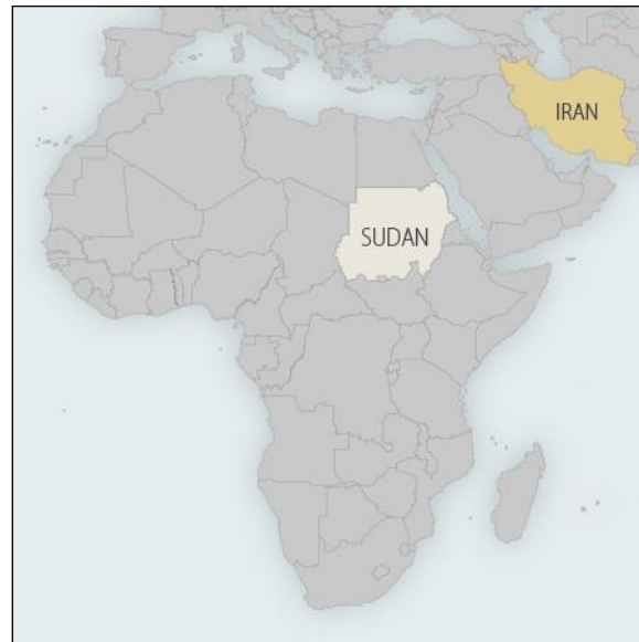
Figure 6. Sudan

Amid the Saudi-Iran dispute in January 2016 over the Nimr execution, several African countries that Iran had cultivated as potential allies broke relations with Iran outright, including Djibouti, Comoros, and Somalia, as well as Sudan. Senegal, at one time seen as a primary focus of Ahmadinejad's Africa outreach, and Sudan have supported the Saudi-led military effort against the Iran-backed Houthis in Yemen—in Sudan's case with some forces. 177 The UAE, in particular, has actively sought allies in the Horn of Africa to reduce Iranian influence, including by facilitating UAE operations against the Iran-backed Houthi rebels in Yemen. West Africa's large