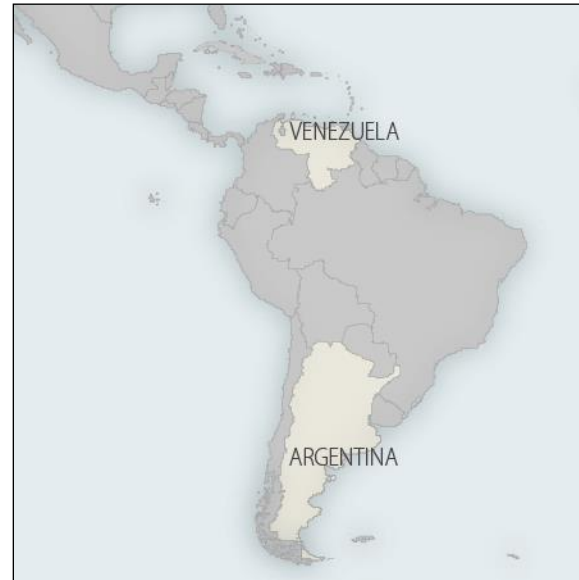
Figure 5. Latin America

Some U.S. officials and some in Congress have expressed concerns about Iran's relations with leaders in Latin America that share Iran's distrust of the United States. Some experts and U.S. officials have asserted that Iran has sought to position IRGC-QF operatives and Hezbollah members in Latin America to potentially carry out terrorist attacks against Israeli targets in the region or even in the United States itself. 165 Some U.S. officials have asserted that Iran and Hezbollah's activities in Latin America include money laundering and trafficking in drugs and counterfeit goods. 166 These concerns were heightened during the presidency of Mahmoud Ahmadinejad (2005-2013), who made repeated, high-profile visits to the region in an effort to circumvent U.S. sanctions and gain support for his criticisms of U.S. policies. However, few of the economic agreements that Ahmadinejad announced with Latin American countries were implemented, by all accounts.