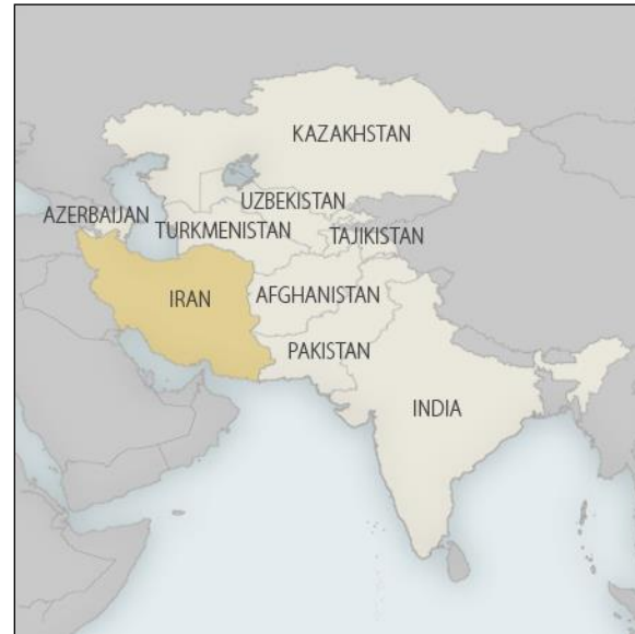
Figure 4. South and Central Asia Region

Most of the Central Asia states that were part of the Soviet Union are governed by authoritarian leaders. Afghanistan remains politically weak, and Iran is able to exert influence there. Some countries in the region, particularly India, seek greater integration with the United States and other world powers and tend to downplay cooperation with Iran. The following sections address countries that have significant economic and political relationships with Iran.