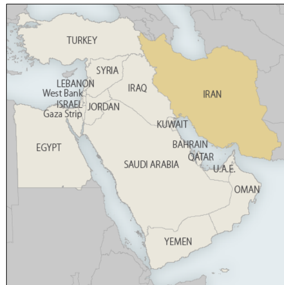
Figure 2. Map of Near East

Several of the GCC leaders have accused Iran of fomenting unrest among Shiite communities in the GCC states. Yet, the GCC states maintain relatively normal trading relations with Iran. In 2017, Iran sought to ease tensions with the GCC countries in an exchange of letters and a