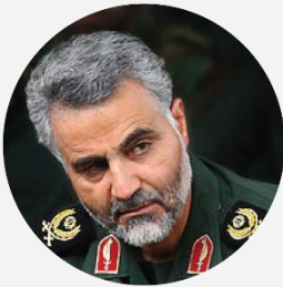
IRGC Major General Qasem Soleimani